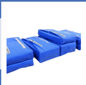
Heavy Duty SMS Sequential Sterilization Wraps