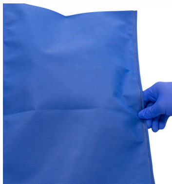
2-Ply SMS, One-Step Super Duty Sterilization Wrap