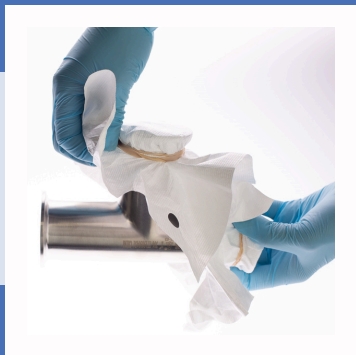
PureClean™ 1421B Tyvek® Sterilization Wrap