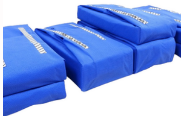
Super Duty SMS Sequential Sterilization Wrap