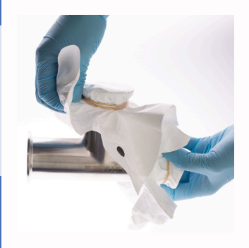
1422A Tyvek® Sterilization Wrap