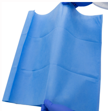
2-Ply SMS, One Step Heavy Duty Sterilization Wrap